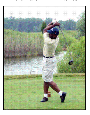
Saturday October 27, 2018

Country View Golf Club 240 W. Beltline Road (FM 1382) Lancaster, Texas 75146